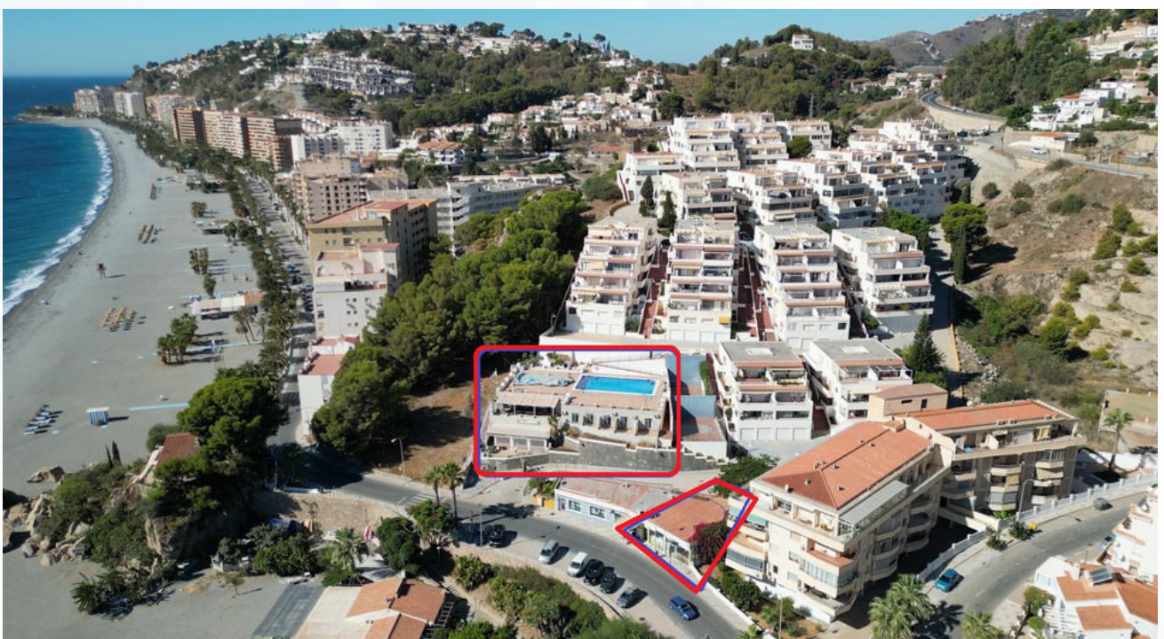
Hotel (left) and storefront (right) boxed in red

We need a permanent home for our YWAM base! Our criteria is that it be strategically located in the the city, close to parks, the beach, and community life. We have found a 6,338 sq. foot hotel for sale that has 13 large bedrooms, a kitchen, and dining areas. Two rooms are suites, and many have three or four beds in them. With bunks, we can house over 40 people! It has balconies and terraces, and gives access to the community pool and sport facilities. The hotel comes fully furnished and has potential for expansion. Next door is a 1,582 sq. foot storefront which would be our community center and DTS classroom. Both properties together are competitively priced at €960,000, which includes a margin for closing costs, a reserve fund, and an improvement to expand the kitchen.