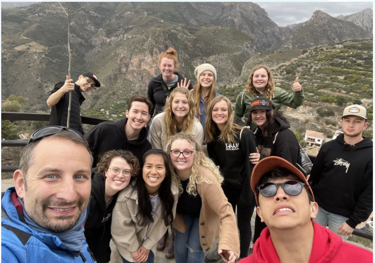
Students and staff from a Discipleship Training School

Unfortunately, the time and costs associated with obtaining a traditional seminary degree are prohibitive for most young people – especially Spaniards. This nation is still struggling with recession and unemployment, particularly among those under 25 years old. Something must be done to reach this nation with the message of Jesus.